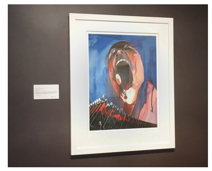
The first print framed and hanging at SFAE, 2017