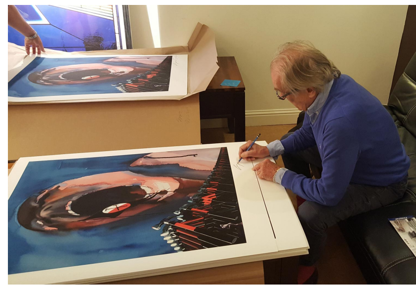
Gerald Scarfe in SFAE signing the brand new limited editions

In this exhibition is featured one of Gerald Scarfe's paintings (among others) titled The Giant Judge and Marching Hammers created in the process of conceptualizing the film, and which captures the intense emotional environment for the main character Pink. This painting is also available for acquisition through SFAE - please contact us for details.